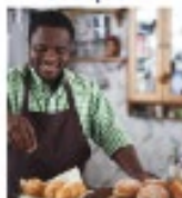
Baking & Pastry VCC