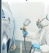
Auto Collision VCC