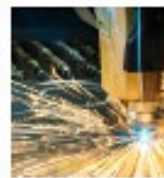
Metal Fabricator BCIT