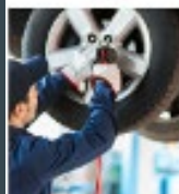
Auto Service Seaquam

Applications are due before spring break